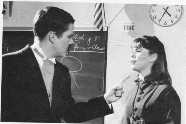
Father's outward gruffness masked his inward gentleness.